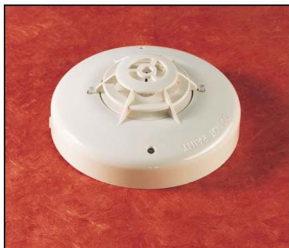
Shown without base